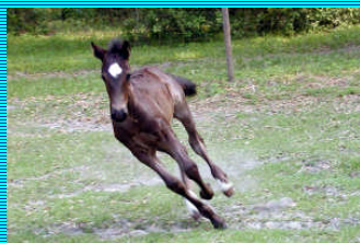
Solstice Lady of the Knight Trefaes Belladonna x Solstice Blaque Knight