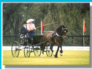
Minyffordd Megastar Good Luck in UK