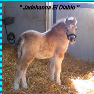
Jadehanna El Diablo *Thorncliffe Princess x *Springbourne Eldorado