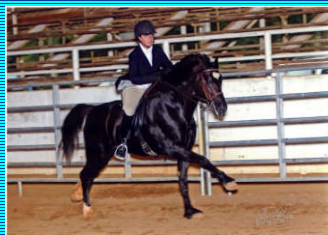
GF Prince Albert Buttonwood Farm MS Gold Show Gallop in Ridden Cob