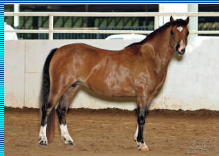
*Thornccliffe Princess Jadehanna Ranch MS Gold Show Halter Sec A Res. Ch