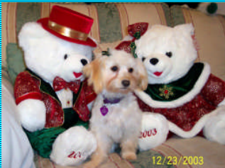
Cleo's First Christmas